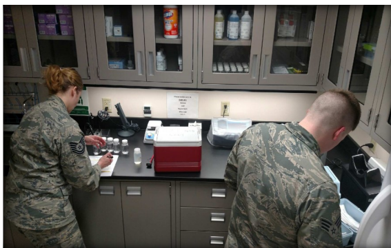
Bioenvironmental Engineering personnel test the base water weekly at various sites throughout Eielson AFB.

You can have the utmost confidence in the team of professionals from the 354 CES Water Treatment Plant, 354 CES Utilities Maintenance, and 354 MDG Bioenvironmental Engineering who are dedicated and committed to providing Eielson AFB with clean safe water.