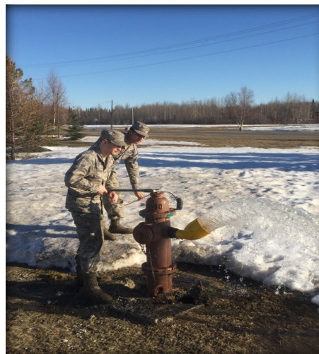
Utilities Maintenance personnel performing routine fire hydrant flushing.