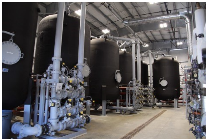
Eielson AFB Water Treatment Plant Granular Activated Carbon system.

If you would like additional information on PFOS and PFOA visit the following web sites: